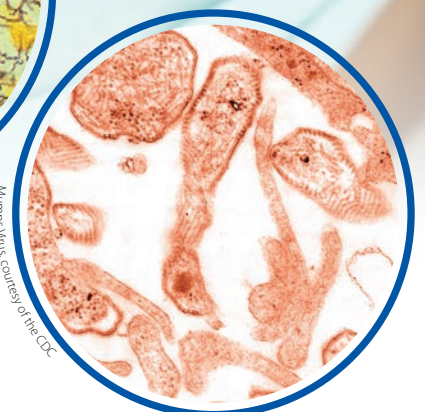
Mumps Virus, courtesy of the CDC